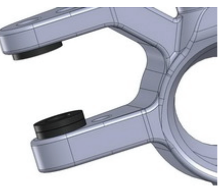
Bump out 2

The stock location maintains very little bump steer (tires parallel) throughout the range of suspension travel. By moving the outer steering link up you can increase the amount of bump steer (tires pointing out) as the suspension compresses.