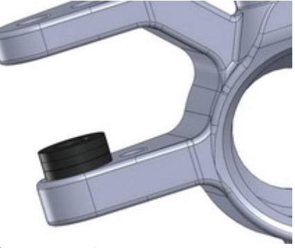
Bump out 3

The stock location maintains very little bump steer (tires parallel) throughout the range of suspension travel. By moving the outer steering link up you can increase the amount of bump steer (tires pointing out) as the suspension compresses.