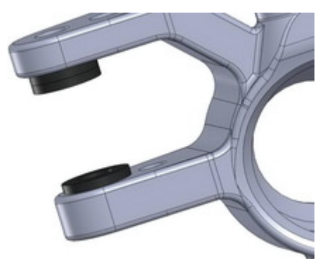
Bump out 1