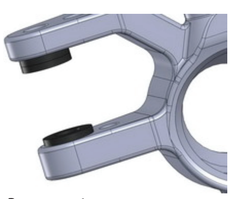
Bump out 1