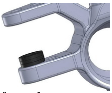
Bump out 3

The stock location maintains very little bump steer (tires parallel) throughout the range of suspension travel. By moving the outer steering link up you can increase the amount of bump steer (tires pointing out) as the suspension compresses.