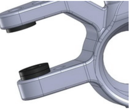
Bump out 2