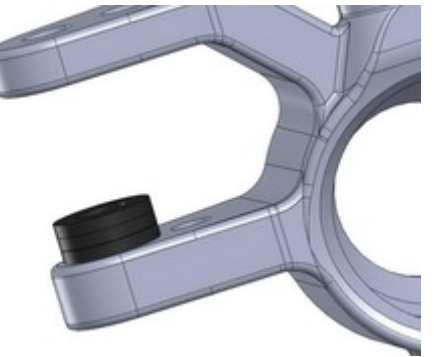
Bump out 3

The stock location maintains very little bump steer (tires parallel) throughout the range of suspension travel. By moving the outer steering link up you can increase the amount of bump steer (tires pointing out) as the suspension compresses.