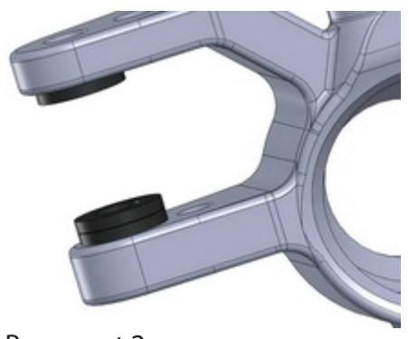
Bump out 2